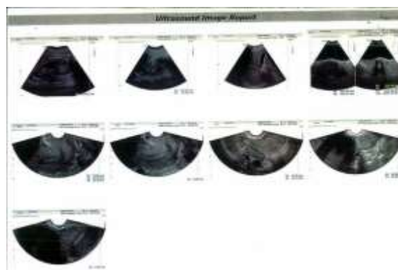
Figure 1: Ultrasound Image Report of Giant Benign Serous Adenoma Cyst of the Left Ovarian with Unusual Clinical Manifestations.

The excised cyst wall was submitted for histopathological evaluation. Pathological examination confirmed the diagnosis of a benign ovarian serous cystadenoma. Cytological analysis of both the cyst fluid and peritoneal washing specimens showed no evidence of malignancy. The postoperative course was uneventful, and the patient was discharged in good general condition. During follow-up, she remained clinically well and reported no complaints. Follow-up ultrasonography performed on August 26, 2024, demonstrated no residual lesion or abnormal findings within the pelvis or adnexal regions, indicating a satisfactory treatment outcome.