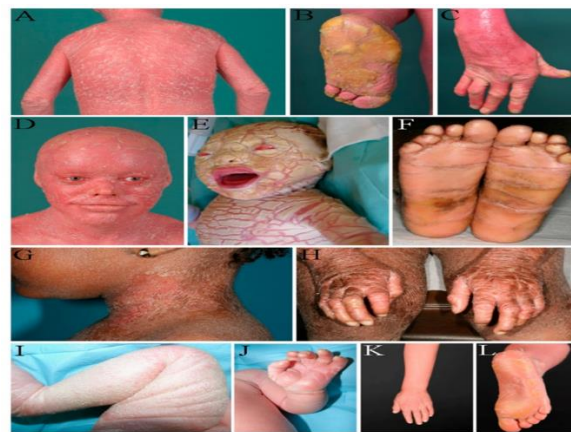
Figure 3. Skin complications and organ involvement in harlequin ichthyosis